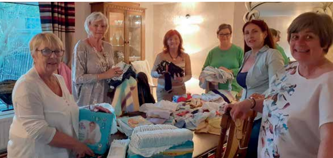
Larne Club Ladies putting together Baby Bundles all 44 of them