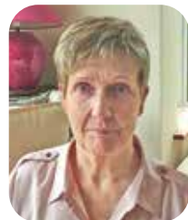
Una Grant International Service